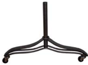
2 pcs – Base Stand