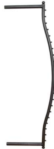
1 pc – Top Rack